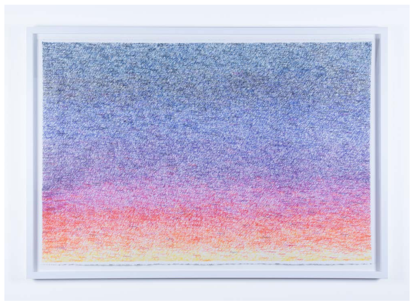
Tragedy Sunset, 2013, 67 x 100 cm, lnk on paper