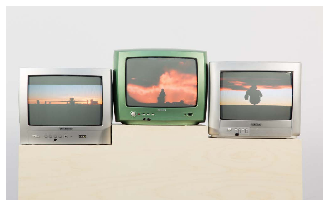
Don't let the sun gown on me from the Day is Done series, 2013, 97 x 111 x 39 cm, Three channel video installation

Day is done is a digital archive of sunset collected from Hollywood films. The sunset are organized by color and subject ans are connected by aligning the horizon line in each film. Sunset is a time of change, a time of hope, and a time of romance. It is the moment when the might takes hold, and the Day is Done.