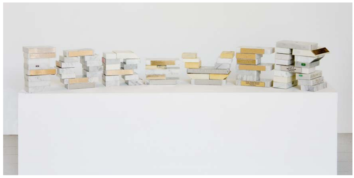
Forever, 2011, 17 x 107 x 29 cm, Marble from discarded trophies