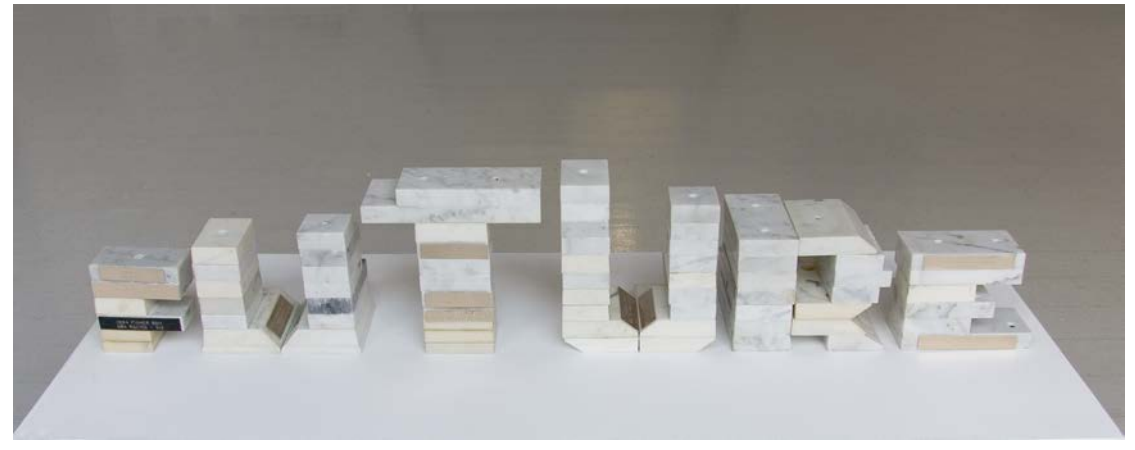
Futur, 2011, 20 x 114 x 17 cm, Marble from discarded trophies