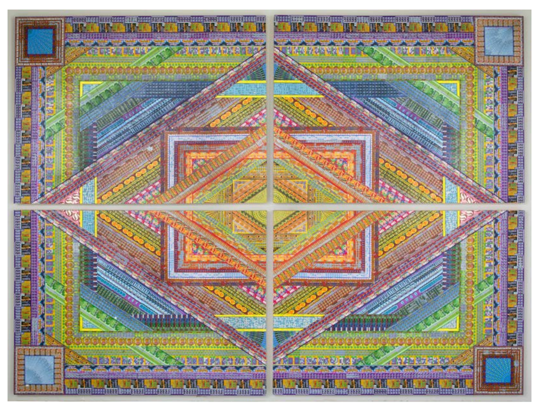
End of spectrum, 2011, 233 x 310 cm, Discarded lottery tickets with UV coat on panel