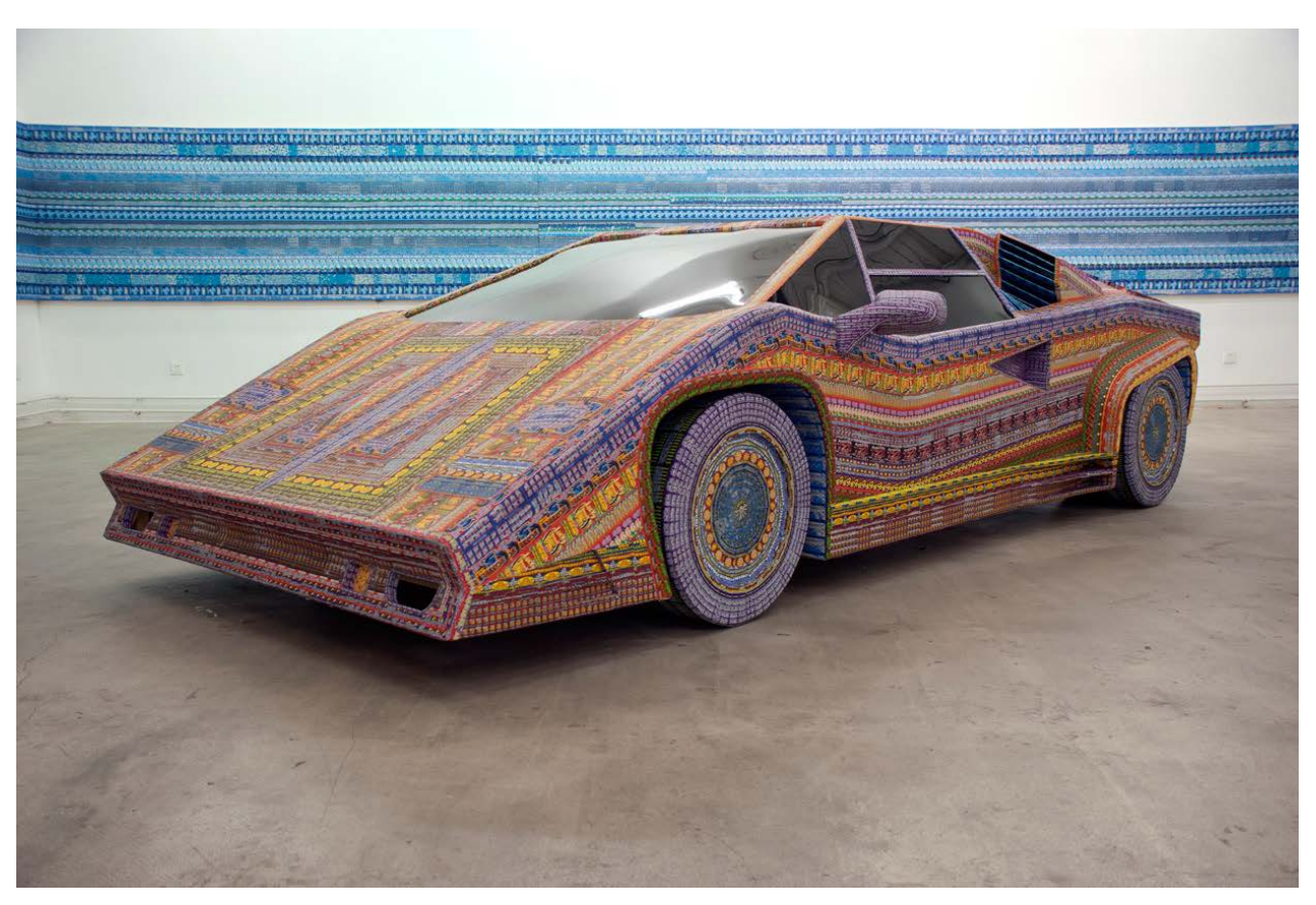
Dream ride, 2010, 110 x 220 x 414 cm, Wood, Plexiglas and discarded lottery tickets with UV coat

7<sup>th</sup> February - 14<sup>th</sup> March 2015 Opening on 7<sup>th</sup> Saturday February 2015 from 6pm to 9pm