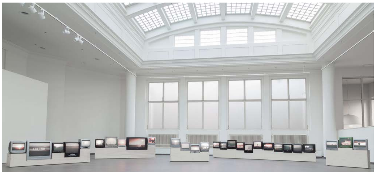
Day is done, 2013, video installation

Day is done is a digital archive of sunset collected from Hollywood films. The sunset are organized by color and subject ans are connected by aligning the horizon line in each film. Sunset is a time of change, a time of hope, and a time of romance. It is the moment when the might takes hold, and the Day is Done.